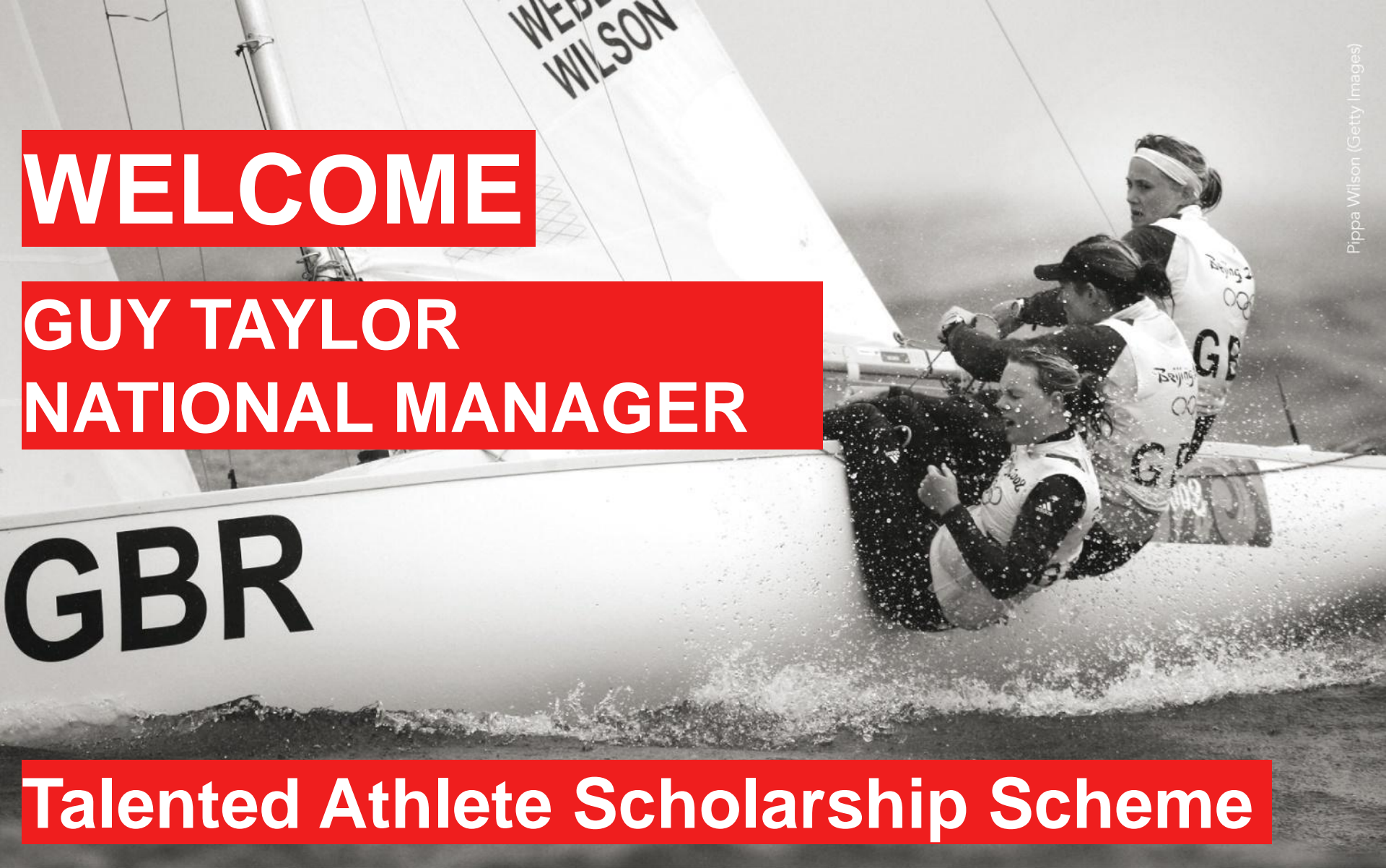
Pippa Wilson (Getty Images)